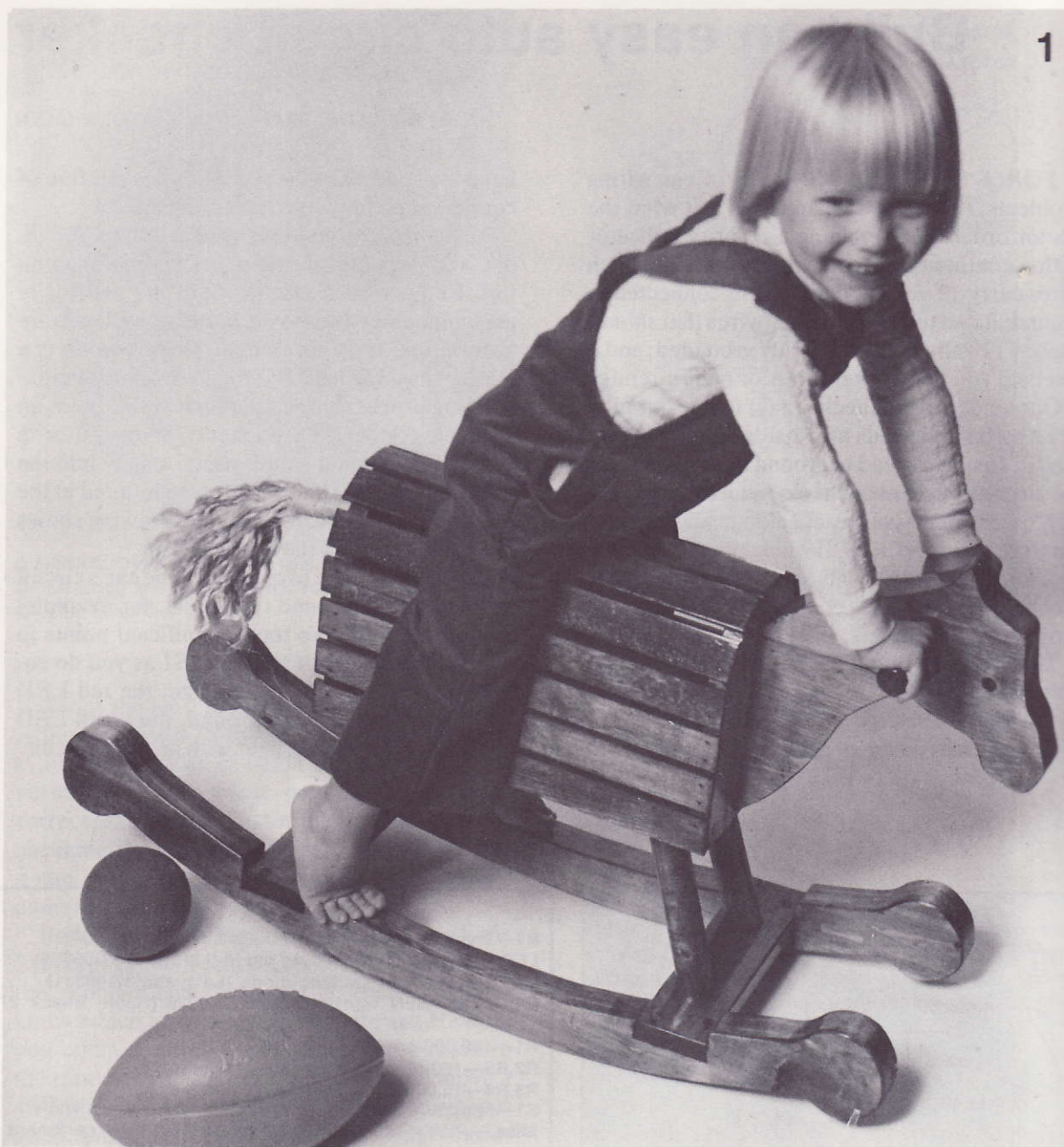
TODDLER'S ROCKING HORSE